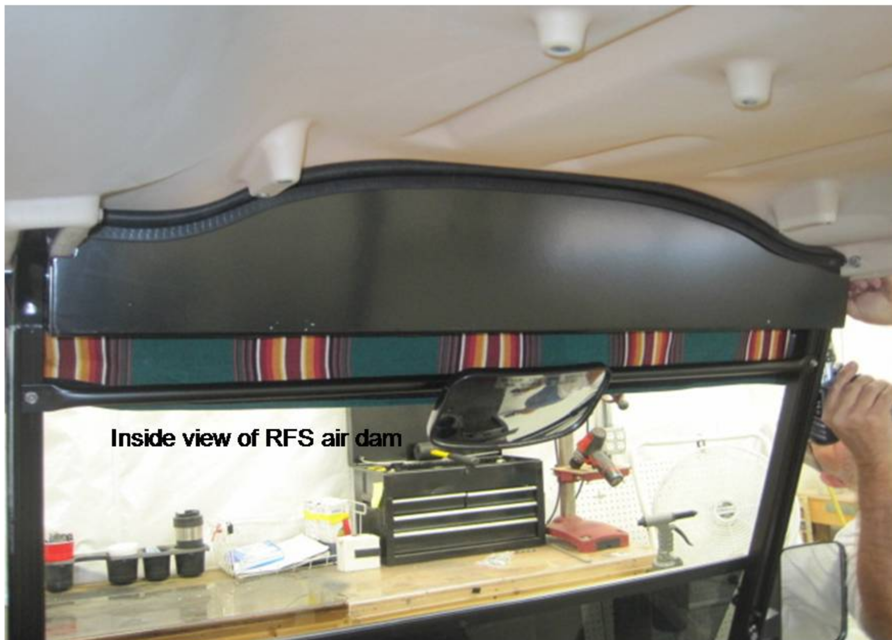
Inside view of RFS air dam