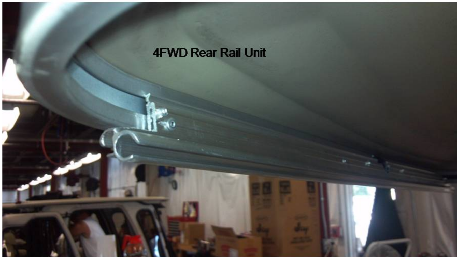
4FWD Rear Rail Unit